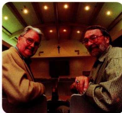
A candidate and his sponsor sit for a photo after an Order of Christian Initiation for Adults (OCIA) class.

I am happy you have responded to the stirrings of the Holy Spirit within you and answered the call to deepen your spiritual practice and journey. The Church needs you. The people of God welcome you. You are beloved among us, and your response in faith is a powerful witness, a reminder to those who may be tempted to take for granted the gift of faith. Thank you. ●