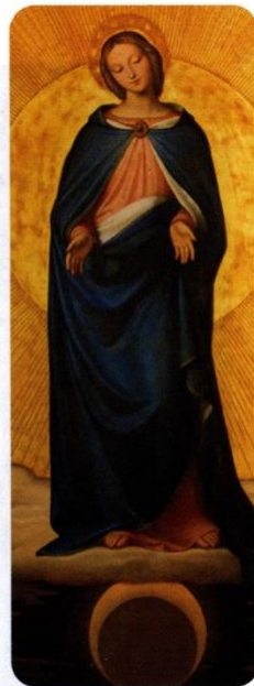
IMMACULATE CONCEPTION BY PHILIP VEIT (1830)

Mary's Immaculate Conception was celebrated many centuries before Pope Pius IX defined it as dogma on December 8, 1854: "The doctrine that maintains that the Blessed Virgin Mary in the first instant of her conception, by a unique grace and privilege granted to her by Almighty God, in consideration of the merits of Jesus Christ the Savior of mankind, was preserved free from all stain of original sin, is a doctrine revealed by God and therefore must be firmly and constantly believed by all the faithful" ( Ineffabilis Deus ). In fact, eight years before, in 1846, the bishops of the United States had already adopted the Immaculate Conception as the patronal feast for Catholics in this country.