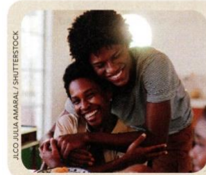
ILCO LILIA AMARAL / SHUTTERSTOCK