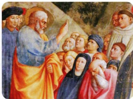
ST PETER PREACHING

Jesus was a first-century Jew, as were his first disciples. They continued their Jewish practices after Jesus' resurrection, but they believed and proclaimed that Jesus was the long-awaited Messiah, the fulfillment of Judaism. Such claims inevitably led to clashes with Jewish authorities, as when St. Stephen, the first martyr, was charged with blasphemy and stoned to death in Jerusalem in the year 36 (Acts 6–7).