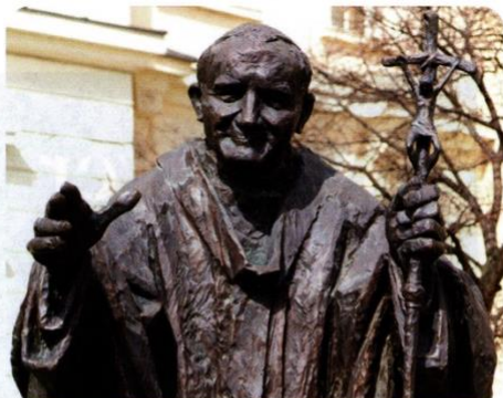
Sculpture of a smiling Pope St. John Paul II outside the Saint John the Baptist Cathedral in Trnava, Slovakia.

Saint Irenaeus (125–202) said that the glory of God is the human fully alive which reflects Jesus' own words, "I came so that they may have life; and have it more abundantly" (John 10:10). Saints enjoy life! The nearsighted St. Alphonsus Liguori (1696–1787), founder of the Redemptorists, sat in the back row of the Naples theater with his glasses off so he could enjoy the music he loved without the distraction of the half-naked chorus line. Saint Teresa of Ávila (1515–1582), caught devouring partridge in the convent kitchen, said, "When I pray, I pray; when I eat partridge, I eat partridge!" Saint Joan of Arc (1412–1431) loved horses, and St. Charles Borromeo (1538–1584) loved chess. Indeed, saints do smile. They even laugh. ●