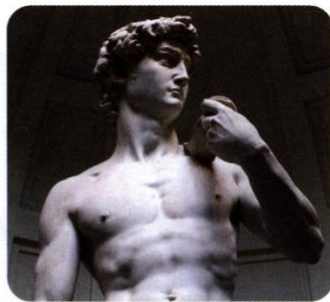
MICHELANGELO'S DAVID